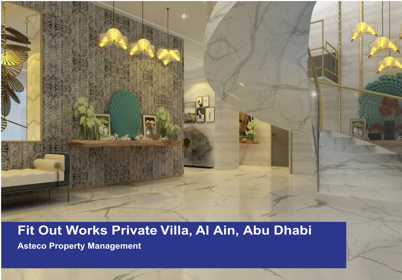
Fit Out Works Private Villa, Al Ain, Abu Dhabi Asteco Property Management