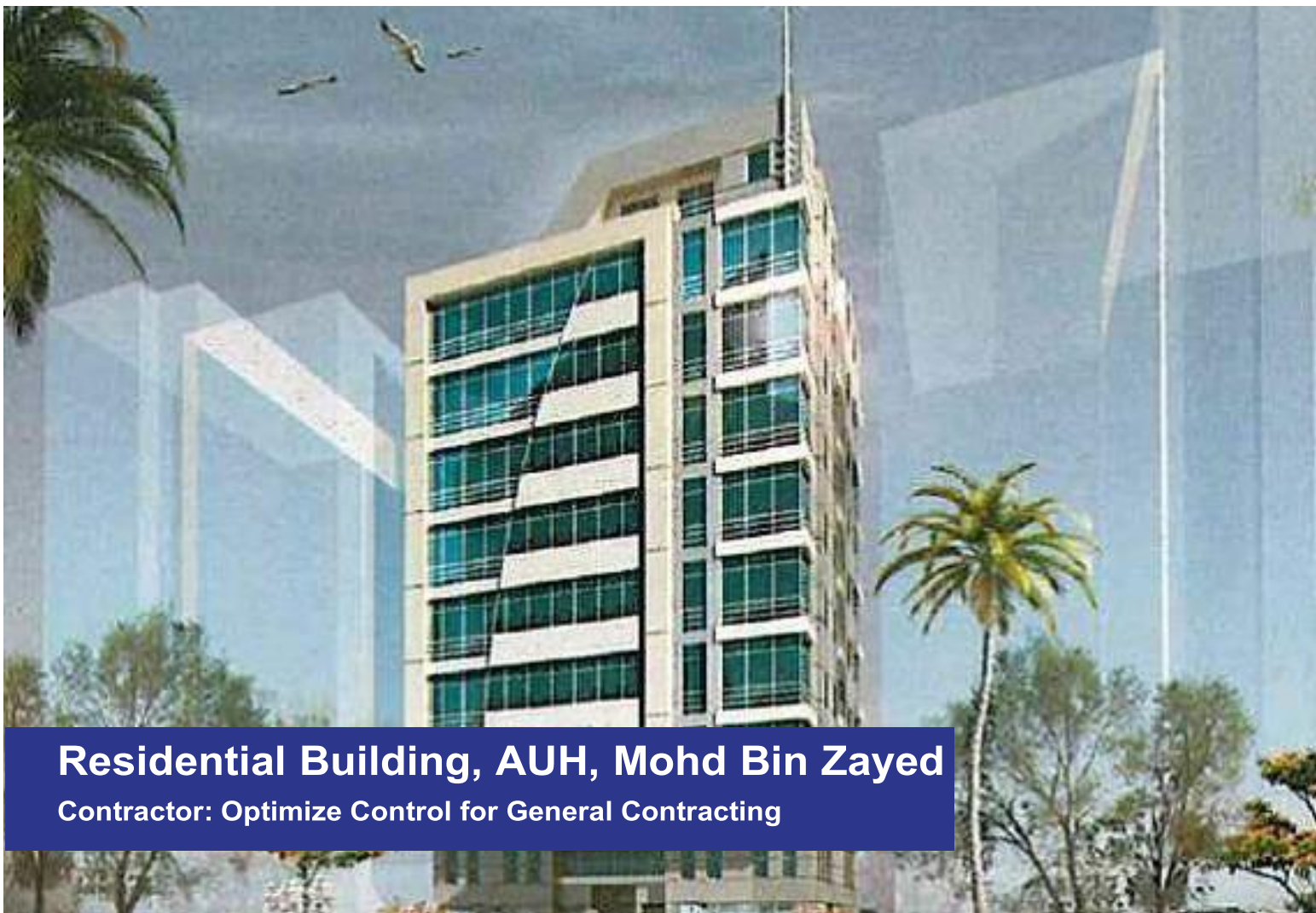
Residential Building, AUH, Mohd Bin Zayed Contractor: Optimize Control for General Contracting